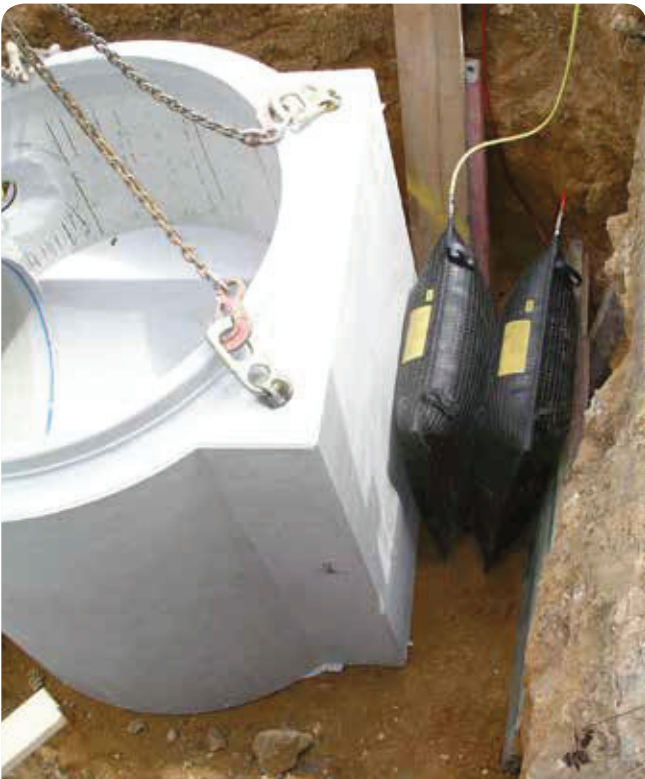
Creating intermediate space