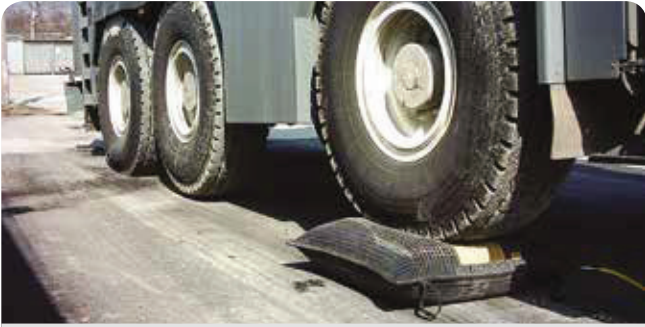
Lifting of trucks