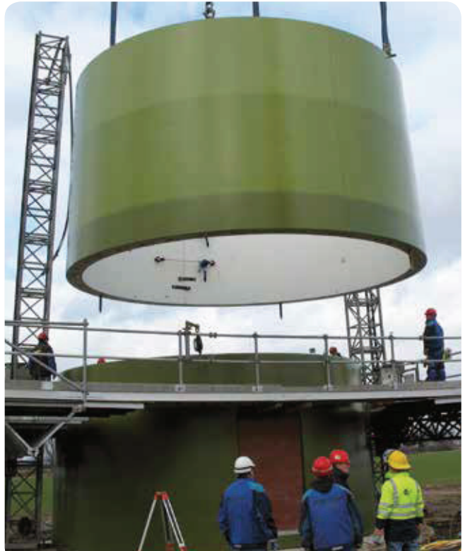
Assembly of wind energy installations