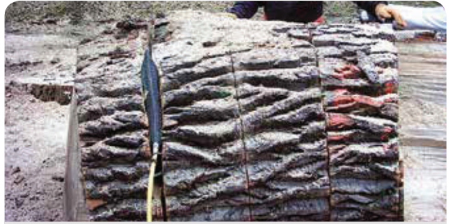
Cleave of a trunk