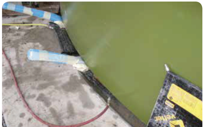
Assembling aid for adjustment of the elements