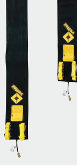
Leak sealing bandage 5 – 20 and 20 – 48 (19 cm / 7.5 inch wide)